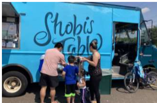
A family getting their beverages as they wait for their meals to be dished up